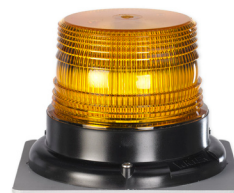
LED Strobe Light